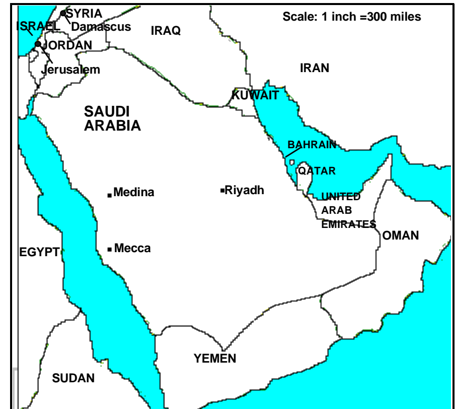
Map of Arabia

He was an orphan, brought up by his grandfather and afterwards by his uncle who was a trader. In his youth, he possibly travelled with his uncle to Jerusalem, Damascus and Yemen.